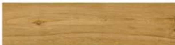
725110 Markham Oak Light