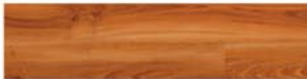
66412 2 Strips Natural Cherry