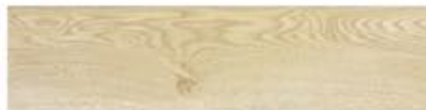
978104 Amsterdam Egg Shell