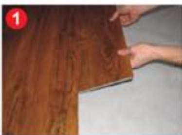
1 Position the 2 planks