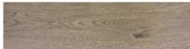
978103 Amsterdam Light Tan