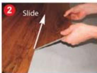
2 Slide Angle the second plank and align the interlocking strips