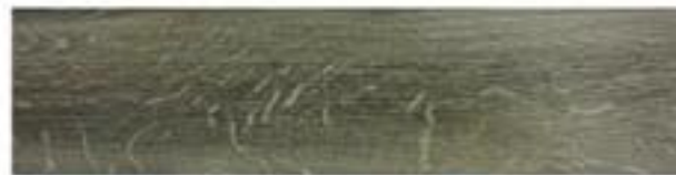
978109 Amsterdam Silver