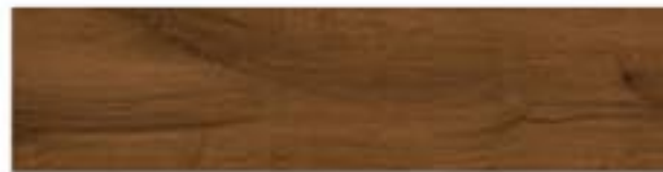
72513 Markham Oak Medium