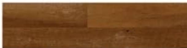
66314 2 Strips Natural Hickory