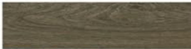
63696 Durban Oak