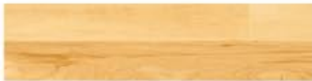
187214 2 Strips Rustic Maple