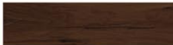
72516 Kentucky Oak