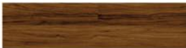
66512 2 Strips Black Walnut