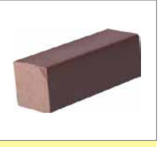
Solid Square Keel