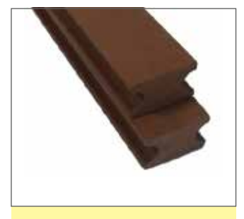
Solid Curve Keel