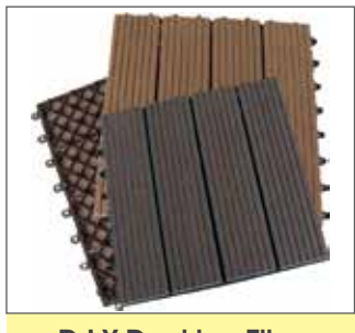
D.I.Y Decking Tiles