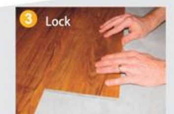
Lock Press down and lock into place