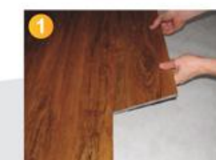
Position the 2 planks