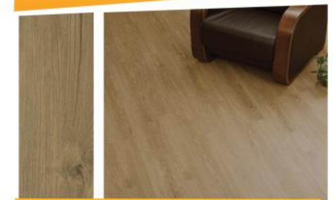
PS 802910 Caramel Oak