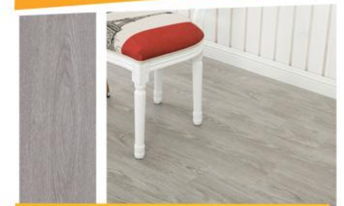
PS 2482 Mocha Oak