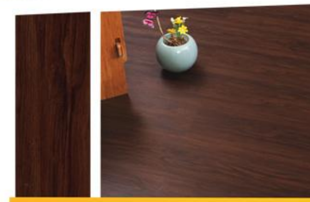
PS 1809 Espresso Oak