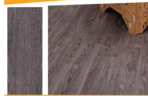
PS 2481 Americano Oak