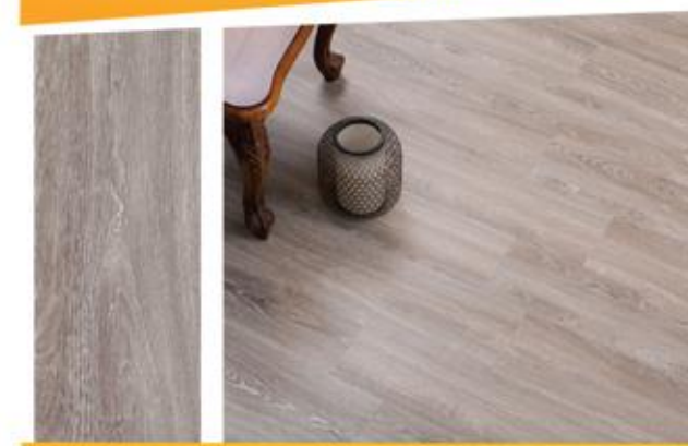
PS 2565 Cappuccino Oak