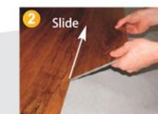
Slide Angle the second plank and align the interlocking strips